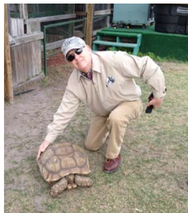
Have a new adventure with your friends at Peace Memorial