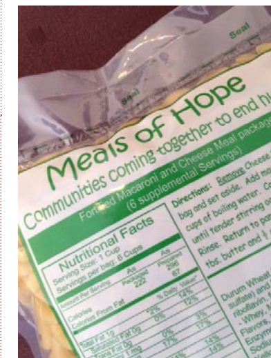
Join us for a food packing event on March 24 to combat hunger

When evening temperature's drop below 40 degrees, Peace Memorial Presbyterian Church volunteers go to work. On these evenings, the adjoining church building becomes base for the Cold Night Shelter, to provide a warm meal and a place to stay for those to might not otherwise