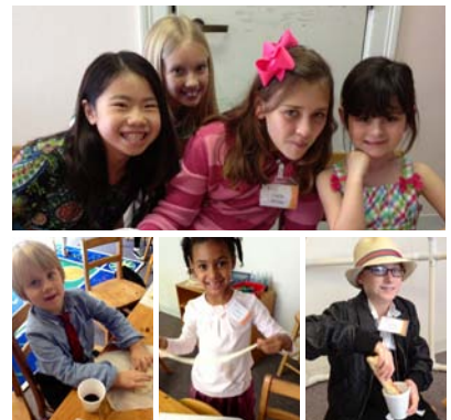
Come be a part of the new beginnings at Peace Memorial.

God of new beginnings, we are walking into mystery. We face the future, not knowing what the days and months will bring us Or how we will respond. Be love in us as we journey. May we welcome all who come our way. Deepen our faith to see all life through your eyes. Fill us with hope and an abiding trust That You dwell in us amidst all our joys and sorrows. Thank You for the treasure of our faith life. Thank You for the gift of being able to rise each day With the assurance of your walking through the day with us. God of our past and future, we praise You.